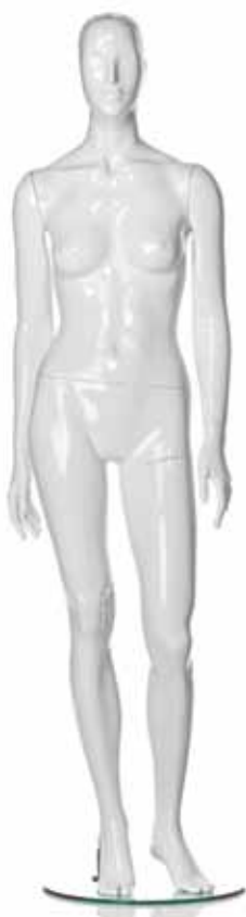
101002-Lin High Gloss white