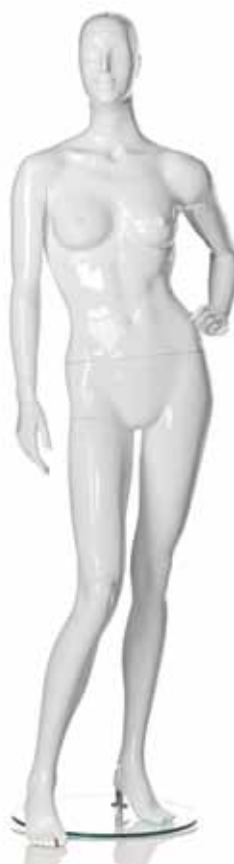
101004-Lin High Gloss white