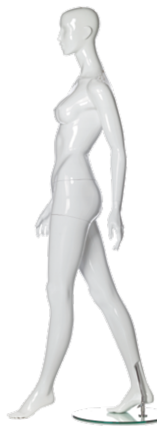
101010-Lin High Gloss white