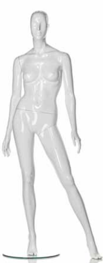
101007-Lin High Gloss white

Our High Gloss serie is also available as male mannequins. Please ask for separate product sheet