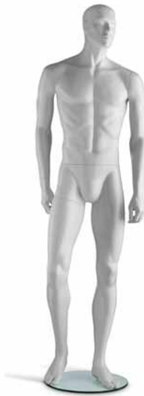
501005-Liam High Gloss white