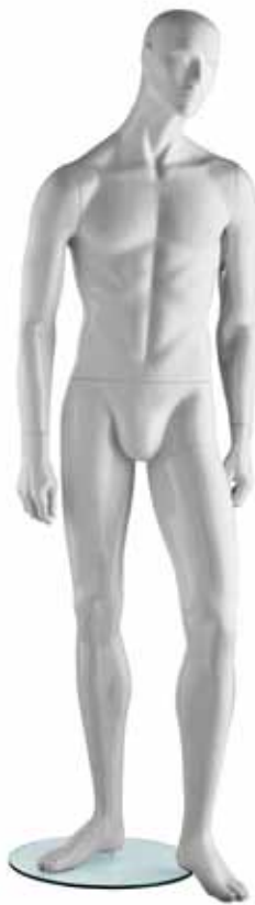
501007-Liam High Gloss white