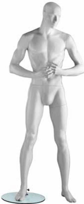
501003-Liam High Gloss white

Our High Gloss serie is also available as female mannequins. Please ask for separate product sheet